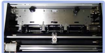
Slitter,cutter and gauge